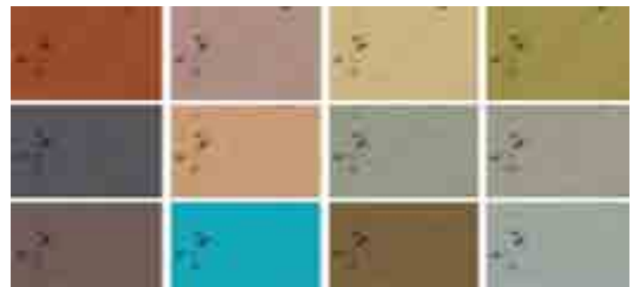
Examples of colours.

50 standard colours from the ProtectGuard® Color Top Coat colour chart. The final shade depends on the initial shade of the substrate.